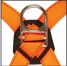
GRADE 316 SS REAR DORSAL D RING