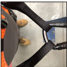
FRONT FALL ARREST ATTACHMENT POINTS