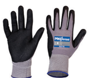
PROSENSE MAXIPRO PALM DIP GLOVE