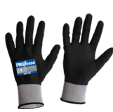
PROSENSE MAXIPRO FULL DIP GLOVE