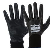
LITE-GRIP FULL DIP W/R NITRILE FOAM