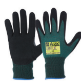
ARAX GREEN CUT C NITRILE SAND DIP PALM