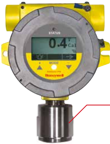
RAEGuard 2 Fixed Sensor Head