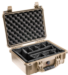
1454 With Padded Dividers