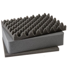
1451 3 pc. Replacement Foam Set