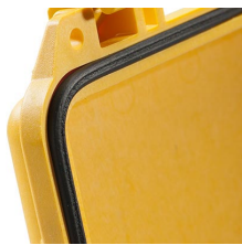
1453 Replacement O-ring