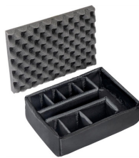
1455 Padded Divider Set