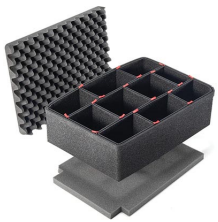
1450TPKIT TrekPak Case Divider Kit