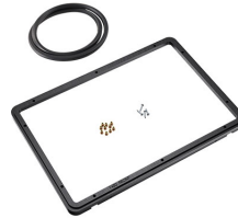
1450PF Special Application Panel Frame