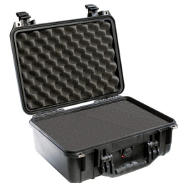
1450WF With Foam