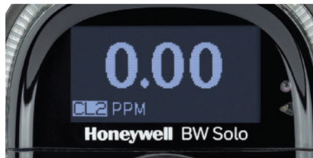
Easy to read