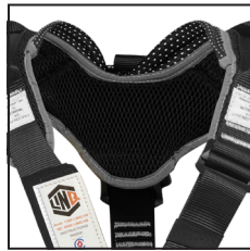
AIR COOL PADDED SHOULDER AND LEGS STRAP