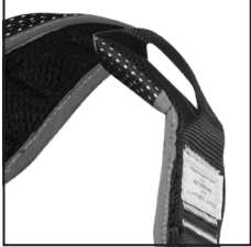
CONFINED SPACE SPREADER BAR ATTACHMENT POINTS