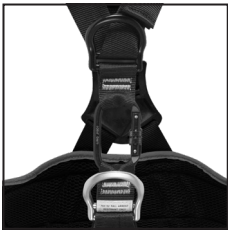
KROLL ATTACHMENT POINT