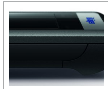
Rubberised handling area for a secure grip