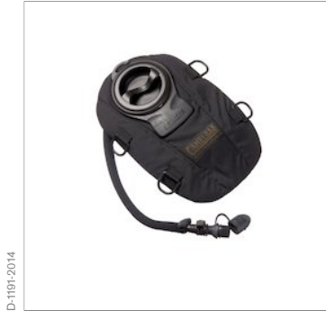
Drink container CamelBak® Pakteen