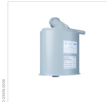
Dräger CO 2 absorber

Drägersorb® 400 is used to absorb acid gases, such as carbon dioxide (CO 2 ), in closed or semi-closed circuit breathing apparatus.