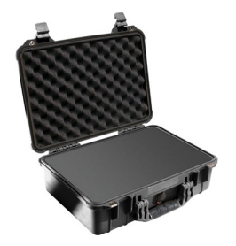
1500WF With Foam