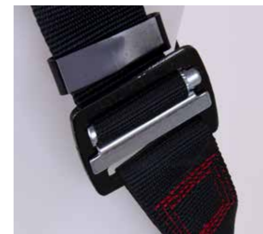
Pass through buckles