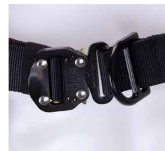
Quick connect buckles