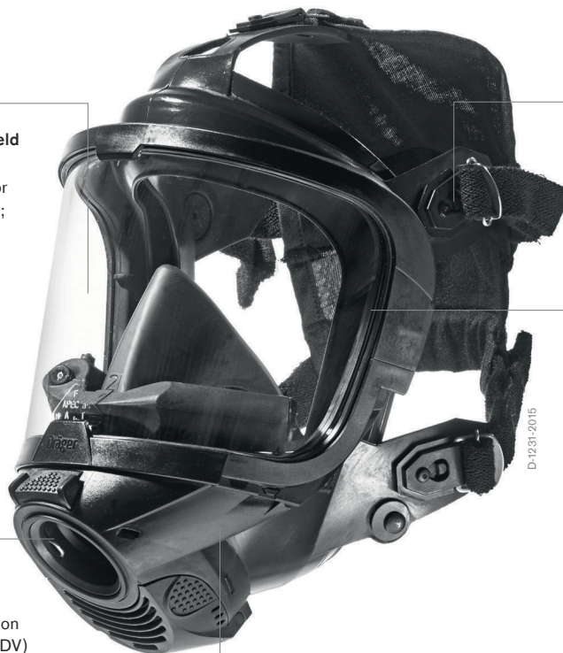
Image shown is NFPA 2013 Edition version of the mask. When used with BG4s or earlier SCBA editions, the mask components may differ.

Designed to support communication system, heads up display (HUD) receiver, and spectacle kit