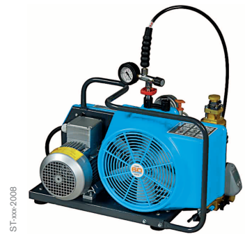
Dräger JUNIOR 100: Mobile and robust: the portable recreational diving compressor fits in any car boot.

The compressor block and drive motor are mounted on a base frame, while the fan is encased in unbreakable, UV-resistant special plastic for optimum cooling. The extremely robust block and a filling mechanism made of stainless steel and Kevlar ensure maximum corrosion-resistance. The Dräger JUNIOR 100 is fully equipped with a micronic suction filter, stainless steel intercoolers and after coolers, an intermediate filter and intermediate pressure safety valves. The compressor is driven by a v-belt. The optional units with electric motor are supplied with a motor protection cable and connection cable. An additional plug is provided for units with 230 V/50 Hz and 400 V/50 Hz. Complete filling mechanism.