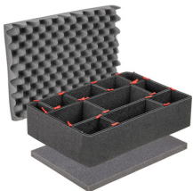
1520TPKIT TrekPak Case Divider Kit