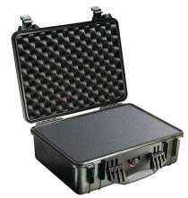
1520WF With Foam