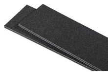
1520TPDIV Extra TrekPak Dividers