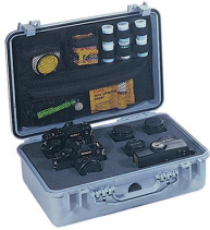
1508 Photographer's Lid Organizer