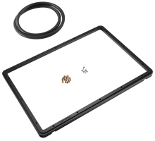
1520PF Special Application Panel Frame