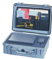
1509 Lid Organizer