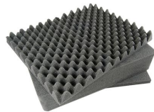
1521 3 pc. Replacement Foam Set