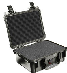
1400WF With Foam