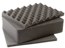
1401 3 pc. Replacement Foam Set