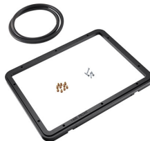
1400PF Special Application Panel Frame