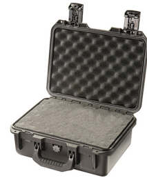
iM2100-X0001 With Foam