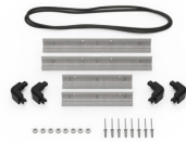
iM2100-BEZEL Base Bezel Kit