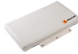
65-95QSEAT Seat Cushion - White