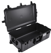
1615NF No Foam