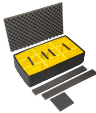
1615AirDS Padded Divider Set