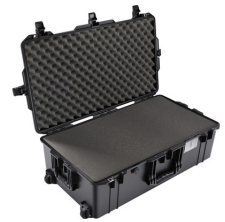
1615WF With Foam