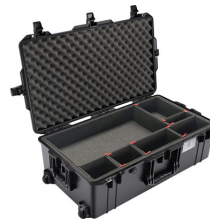
1615TP With TrekPak Divider System