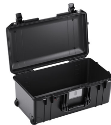
1556NF No Foam