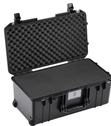
1556WF With Foam