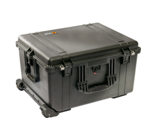
1620NF No Foam