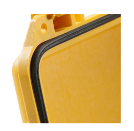
1623 Replacement O-ring