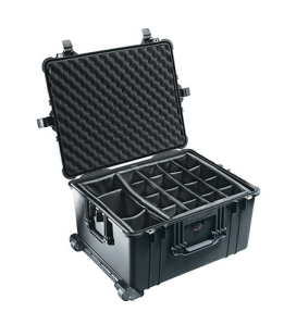
1624 With Padded Dividers