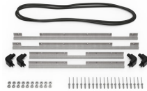
iM2700-BEZEL-LID Lid Bezel Kit