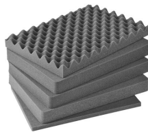
iM2450-FOAM 5 pc. Replacement Foam Set