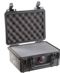
1150WF With Foam