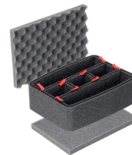
1150TPKIT TrekPak Case Divider Kit