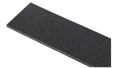
1150TPDIV Extra TrekPak Dividers