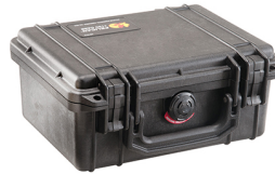
1150NF No Foam