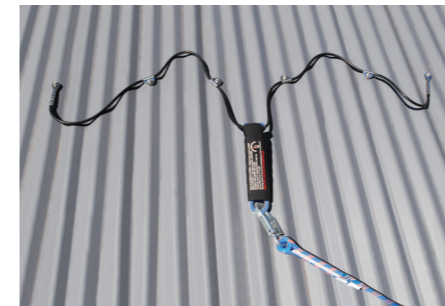
Roof anchor for metal roofs

A label indicating the condition or defect should be attached to the equipment, and it should be examined by a competent person who will decide whether the equipment is to be destroyed or repaired if necessary and returned to service. In the latter case, details of any repair shall be documented and a copy given to the operator.