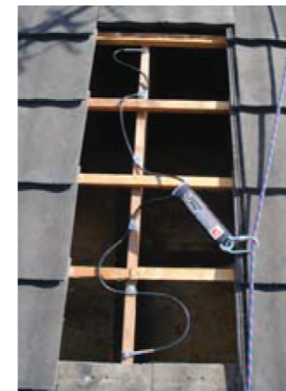
Roof anchor for tiled roofs

Read entire instructions before installing this product and install in accordance with these instructions. Failure to follow all warnings and instructions may result in a serious injury or death.