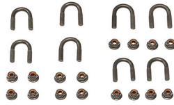
RFMTTC2 Roof Mount Tubular Clamp Kit