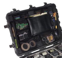
1669 Photo/Lid Organizer