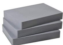
1662 Pick N Pluck™ Sections Only (set of 3)