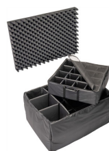
1665 Padded Divider Set