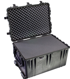
1660WF With Foam