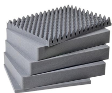
1661 5 pc. Replacement Foam Set