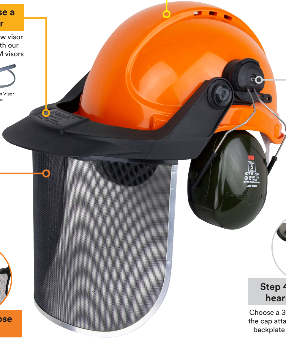
Aluminium Visor Holder